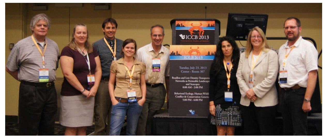
First results were presented at a transsectional symposium at ICCB 2013 in Baltimore.

Nuria Selva and Pierre Ibisch, both members of the Policy Committee of the Europe Section, delivered papers on the European perspective on roadless areas and biodiversity and on a first assessment of the global roadless areas. The presentations were a result of an ongoing cooperation with Google and Kriton Arsenis, Member of the European Parliament.