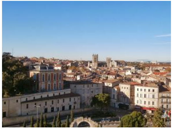
View of the old city from the top of the venue.

For more information visit the website: http://www.iccb-eccb2015.org/