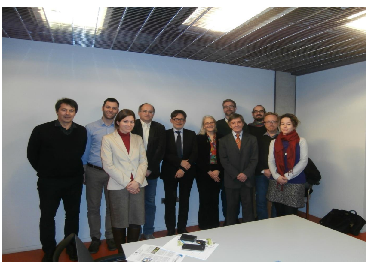
SCB Europe Section meeting, Montpellier, France, 2014.

The mission of the Europe Section is to promote conservation biology and its application to conserve Europe's biological diversity.