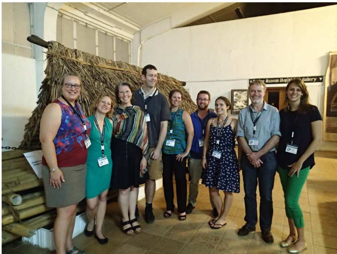
SCBO Board members celebrate the conference success at the closing banquet.

This is a brief overview of conference planning, highlights, outputs and our financial report. We are pleased to report that through the efforts of our sponsors and planning committee, the SCBO Fiji conference was able to generate a profit of approximately FJ$28,012.75 (~US$14,859), prior to deduction of wire transfer fees and any differences subject to exchange rates.