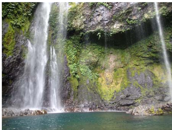
LEFT: Members of VOU dance troupe performing during opening ceremony. RIGHT: Field trip encounter with the Nabalasere waterfall.