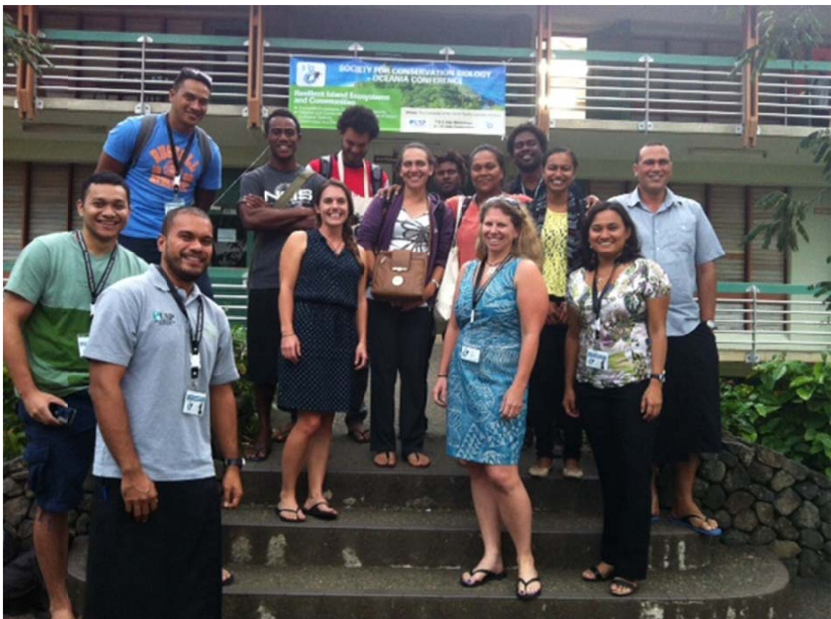
Participants and facilitators of the Scientific Writers and Presenters Workshop.

The workshops focused on practical, capacity-building activities. The scientific writers and presenters workshop was targeted at university students seeking tips to get their research noticed. The Wildlife Conservation Society Fiji Country Program supported participation of Fiji Fisheries Department staff from around the country to learn insights from their colleagues from the Vanuata Fisheries Department and the Secretariat of the Pacific Community about latest developments in sea cucumber management. The social network analysis workshop showcased the latest tools for identifying properties of social networks, as well as brainstorming ideas to weave networks together to improve conservation implementation. The implementation gap workshop drew from activities in the Frog Design's Collective Action Toolkit to explore conservation issues concerning multiple priorities and scale mismatch in Oceania.